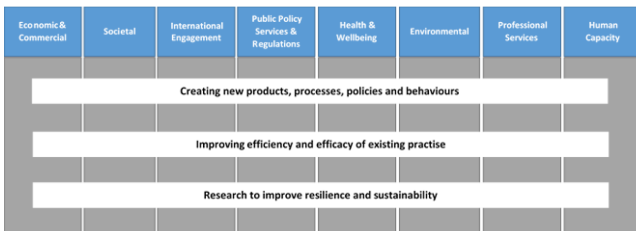
Figure 1. SFI Impact Classification

Impact can be described as the demonstrable contribution that excellent research makes to the economy and society. Impact embraces the diverse ways in which research-related knowledge and skills benefit individuals, organisations and nations. SFI classifies the impacts of scientific research according to 8 pillars which are underpinned by 3 thematic areas and these are summarised in Figure 1 below.