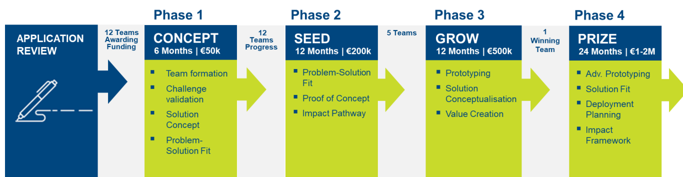
Figure 1. Example of phased structure of a challenge programme under the National Challenge Fund.

At the conclusion of the Concept Phase, all teams that are deemed competitive and whose project demonstrates high impact potential may progress to the Seed Phase. Following the Seed Phase, a number of teams will progress to the Grow Phase as finalists, where they will receive up to €500k, and will ultimately compete for the overall Prize award.